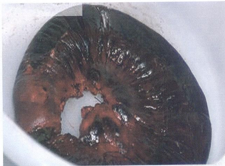
Fig. (5): Bowel gangrene due to venous occlusion